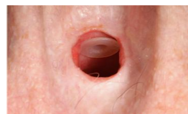
Voice prosthesis in situ