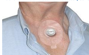
Stoma baseplate and HME cassette