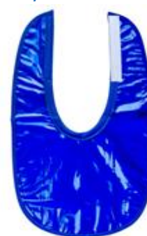
Stoma shower shield