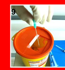
Dispose of sharps & equipment