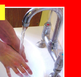
Clean hands with alcohol hand rub or soap & water