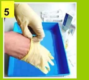
Apply non-sterilized gloves and plastic apron (use sterilized gloves if you must touch Key-Parts)