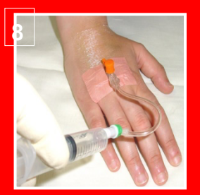
Administer drugs using NTT