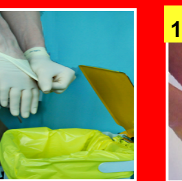
Dispose of gloves then apron & immediately...