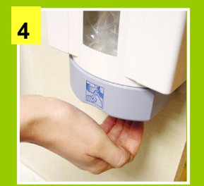
Clean hands with alcohol hand rub or