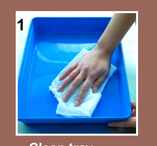
Clean tray according to local policy