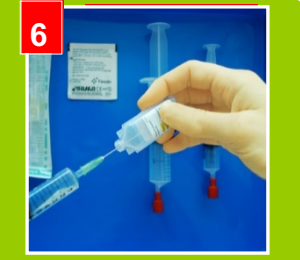
Prepare Equipment protecting Key-Parts with non-touch technique (NTT) and Micro Critical Aseptic Fields (Caps & Covers)